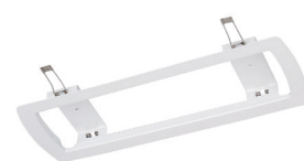
NEBRASKA SEMI-RECESSED MOUNTING KIT