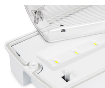
NEBRASKA HINGED GEAR TRAY WITH QUICK-RELEASE CATCHES