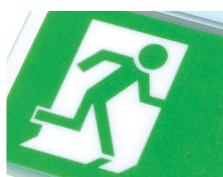
"MAN RUNNING THROUGH DOOR" V2 LEGENDS AVAILABLE AS UP, DOWN, LEFT & RIGHT