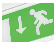
STANDARD LEGENDS AVAILABLE AS UP, DOWN, LEFT & RIGHT