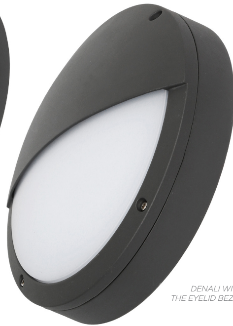
DENALI WITH THE EYELID BEZEL