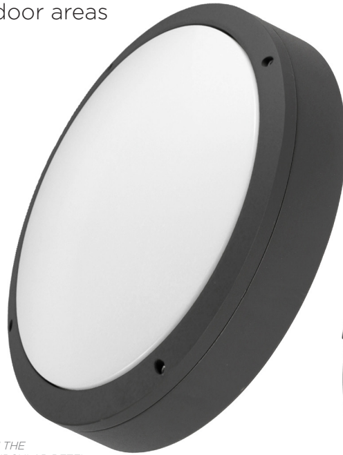
DENALI WITH THE STANDARD CIRCULAR BEZEL

Surface fittings for commercial outdoor areas