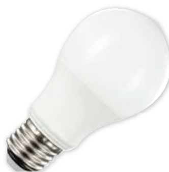
E27 Bulb Required