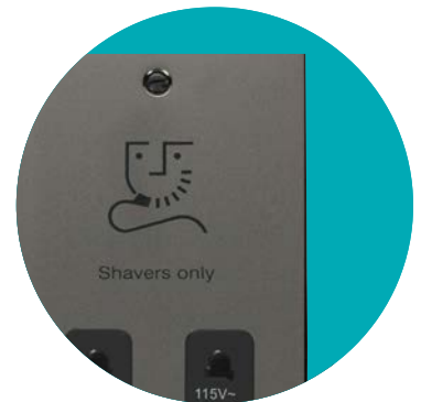
Black Nickel (BN)