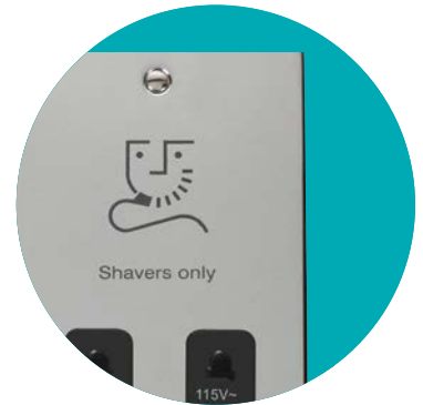
Polished Chrome (CH)