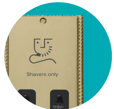
Georgian Cast Brass (GCBR)