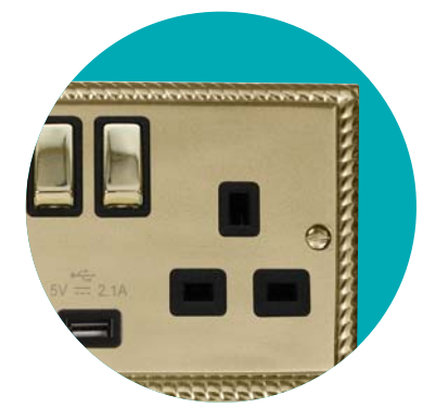
Georgian Cast Brass (GCBR)