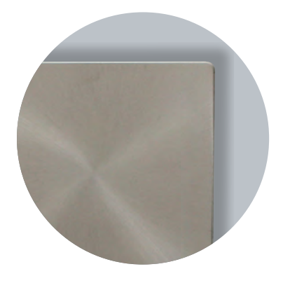
Brushed Steel (BS)