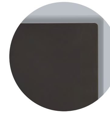
Matt Black (BK)