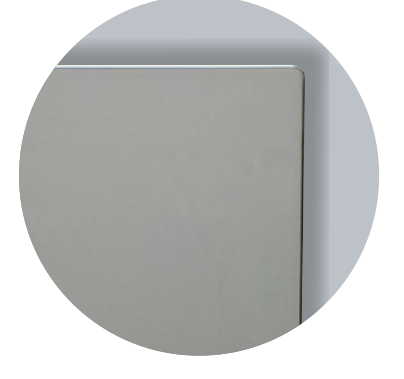
Polished Chrome (CH)