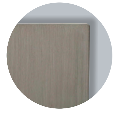
Stainless Steel (SS)