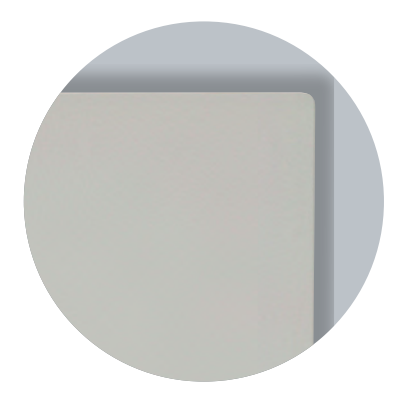
Polar White (PW)