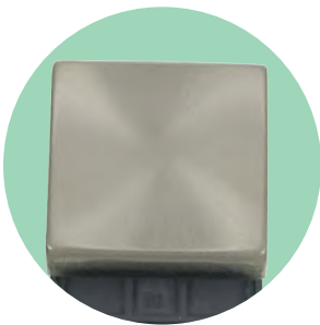
Satin Chrome (SC)