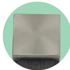
Brushed Steel (BS)