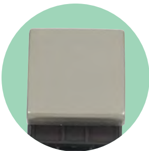
Pearl Nickel (PN)