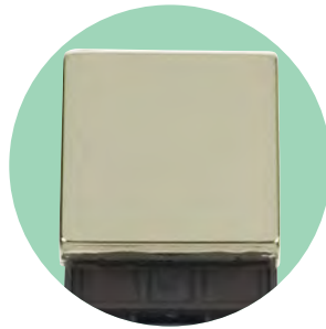
Polished Brass (BR)