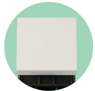
Polar White (PW)