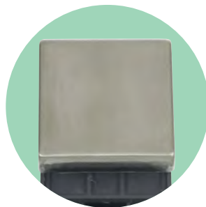
Stainless Steel (SS)