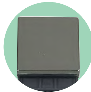
Black Nickel (BN)