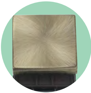
Antique Brass (AB)