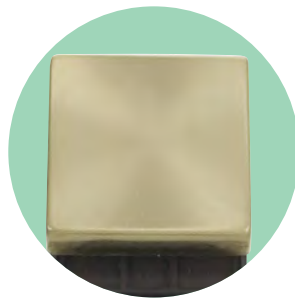
Satin Brass (SB)