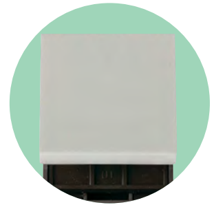
Click White (WH)