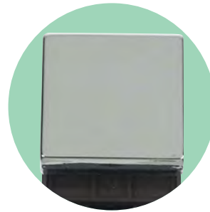
Polished Chrome (CH)