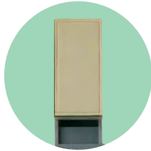
Polished Brass (BR)