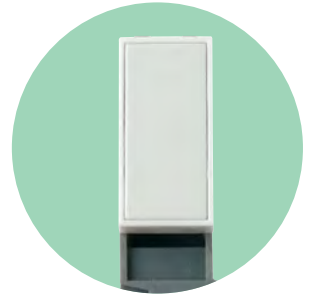
Click White (WH)