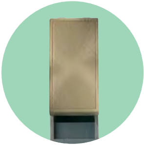
Antique Brass (AB)