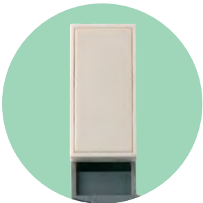
Pearl Nickel (PN)