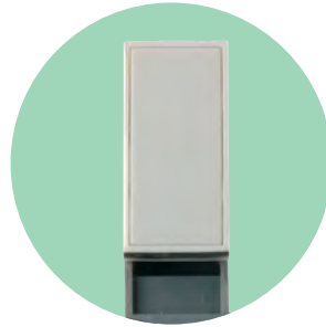
Polished Chrome (CH)