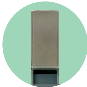
Stainless Steel (SS)