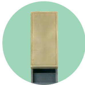
Satin Brass (SB)