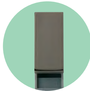
Black Nickel (BN)