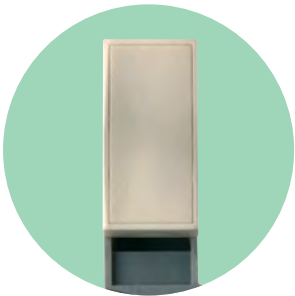
Satin Chrome (SC)