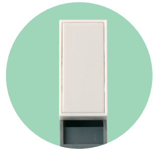
Polar White (PW)