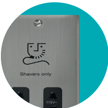
Stainless Steel (SS)