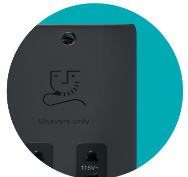
Black Nickel (BN)