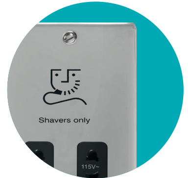
Polished Chrome (CH)