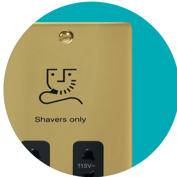
Polished Brass (BR)