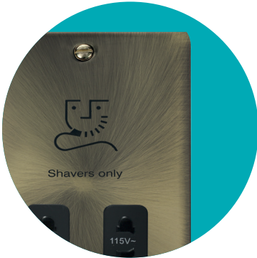
Antique Brass (AB)