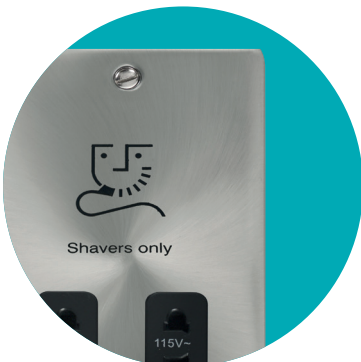
Satin Chrome (SC)