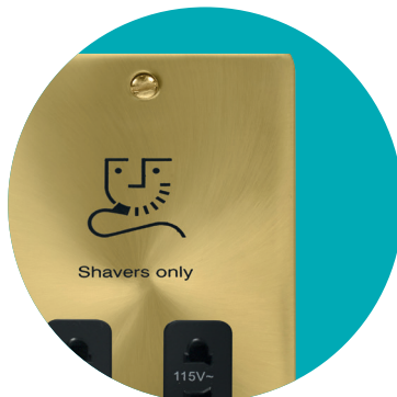
Satin Brass (SB)