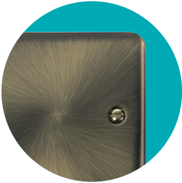
Antique Brass (AB)