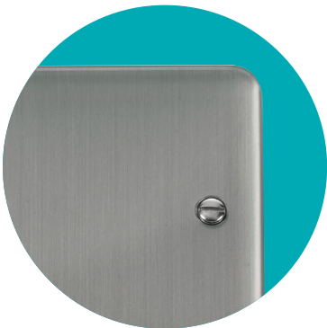
Stainless Steel (SS)