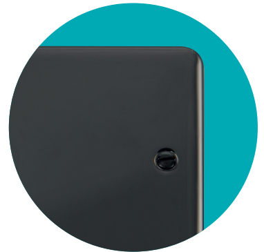
Black Nickel (BN)