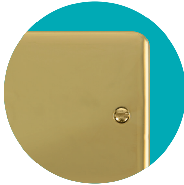
Polished Brass (BR)