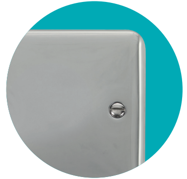
Polished Chrome (CH)