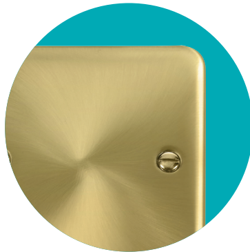
Satin Brass (SB)