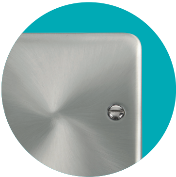
Satin Chrome (SC)