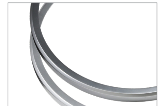
OPTIONAL TRIM AVAILABLE IN CHROME & SATIN-CHROME