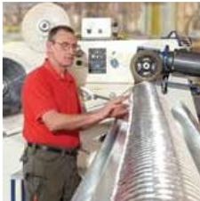
Aluminium ducting extrusion

Manrose also manufacture a complete range of spiral ducting available in rigid aluminium, PVC, laminated aluminium and insulated aluminium ducting.