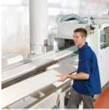
Low Profile Ducting extrusion