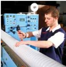
PVC ducting extrusion