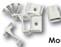
UCMCP Mounting Clips

UC250LL - 250mm / UC500LL - 500mm / UC1000LL - 1000mm