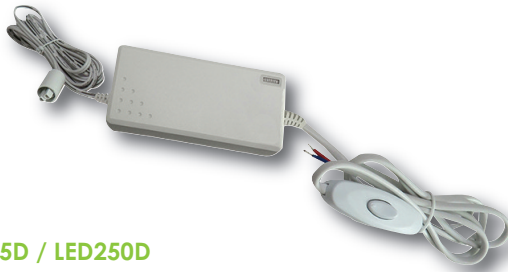
LEDD125D / LED250D