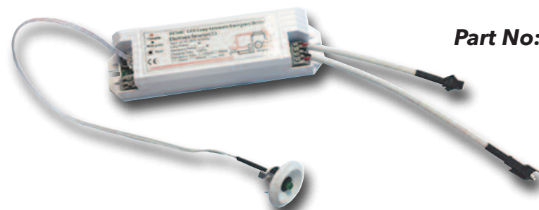
Part No: LEDLEP