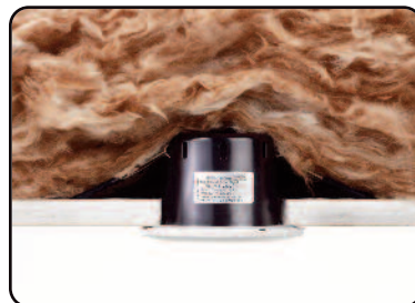
Insulation can be placed directly over the fitting

VELA Compact downlights have been independently tested to the British Standard 60598-1 Clause 12.4 by the Lighting Industry Association. Contact us for copies of the full test report.