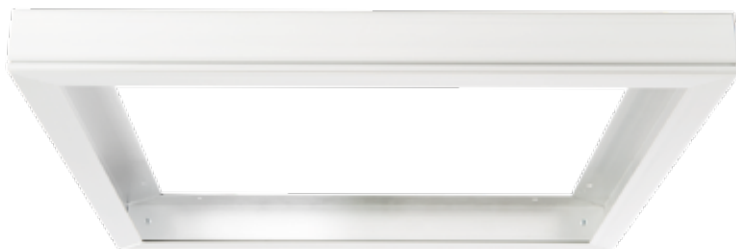
LP60SMF - Surface mounting frame