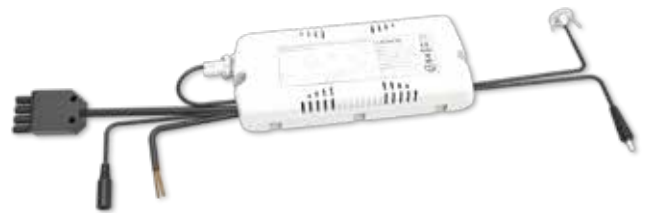
LED3EP80-OJ - Emergency pack

Tech Help Line UK - 0845 194 7584 Non UK - +44 (0)1952 238 100