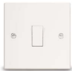
Durable, scratch resistant thermoset material