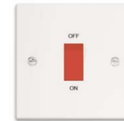
45 Amp Switches