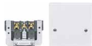
979 (internal view)