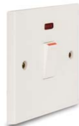
Flush neon lens