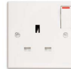
13 Amp Sockets