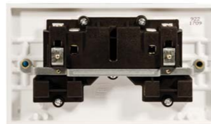
Angled in-line terminals with captive screws