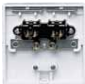
954 (rear view)