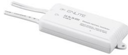
ETran™ 20-60W/VA Dimmable Electronic Transformer