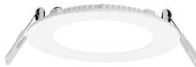
Slim-Fit™ 6W IP44 Round Low Profile LED Downlight