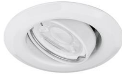
EDLM™ GU10 Pressed Steel Adjustable Downlight