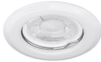
EDLM™ GU10 Pressed Steel Fixed Downlight