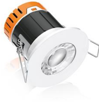
E5™ Fixed 4.5W Dimmable Fire Rated LED Downlight