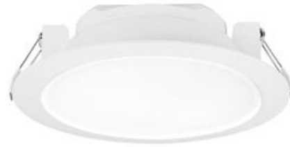
Uni-Fit™ 240V 20W Integrated IP44 Dimmable LED Downlight