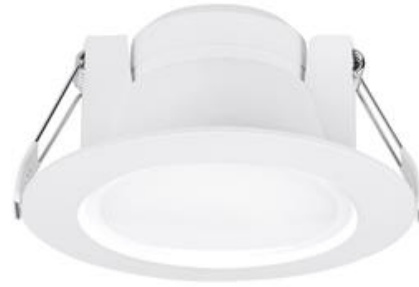
Uni-Fit™ 240V 10W Integrated IP44 Dimmable LED Downlight