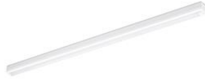
EcoT8™ 1800mm 27W IP20 Single Open T8 LED Batten