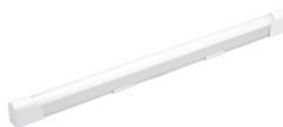
Eco8™ 1200mm 20W Polycarbonate LED Batten