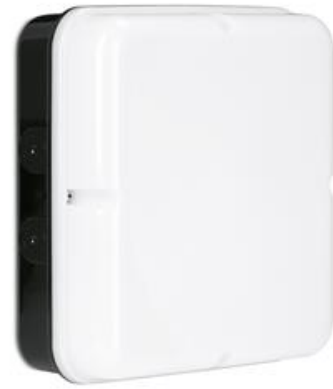
UtiliteDrum™ 18W Polycarbonate IP65 Square Drum LED Bulkhead