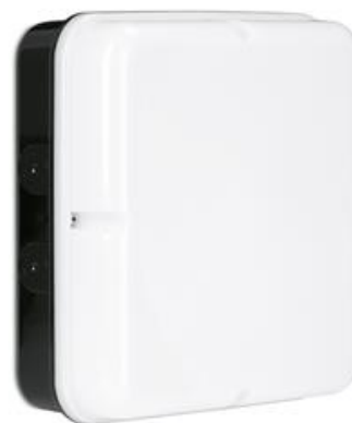
UtiliteDrum™ 18W Polycarbonate IP65 Square Drum LED Bulkhead