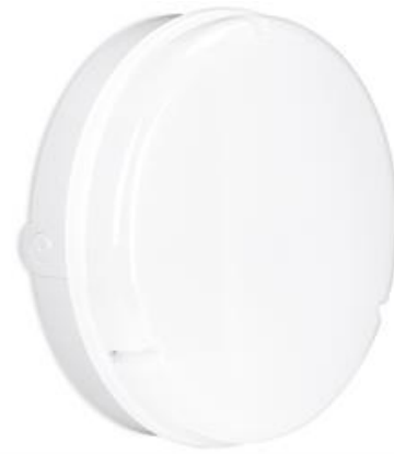
UtiliteDrum™ 18W Polycarbonate IP65 Round Drum LED Bulkhead