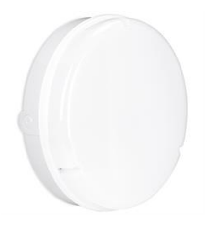
UtiliteDrum™ 18W Polycarbonate IP65 Round Drum LED Bulkhead