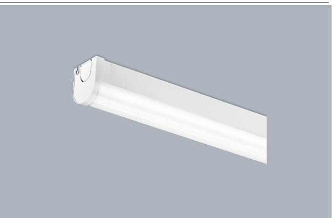
BatPac™ PRO 1800mm 73W LED Batten