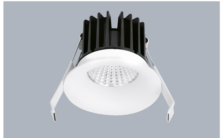
CurveE™ 7W Baffled Dimmable IP44 LED Downlight