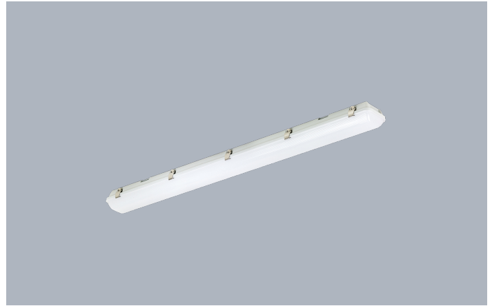
LinearPac™ 1800mm 69W IP65 LED Anti-Corrosive