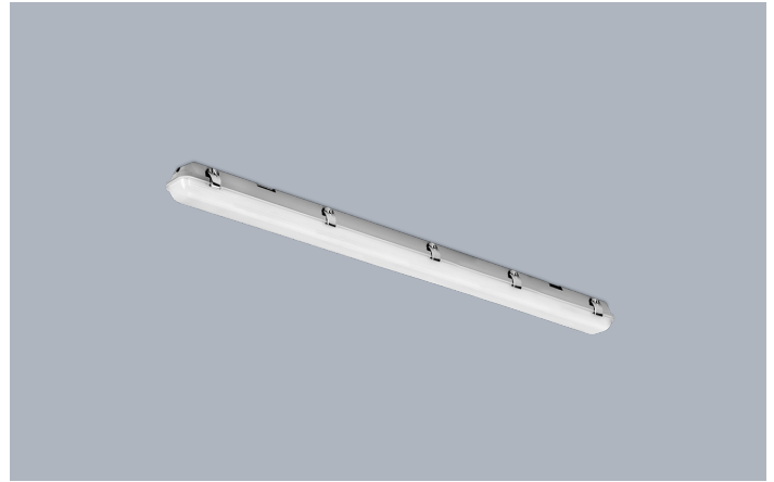
LinearPac™ 1800mm 34W IP65 LED Anti-Corrosive